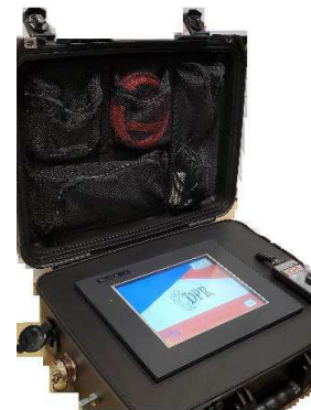
Figure 1 a) Silver Security Help Screen [16] 1 b) Digital Pressure Recorder [20]