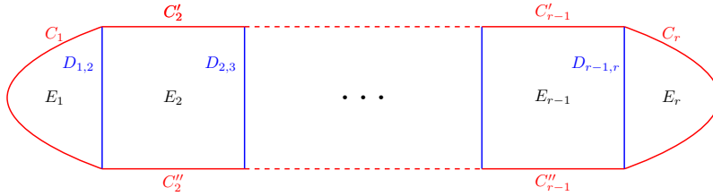
Figure 2. Exceptional divisor E of Type III_1

Note that (iv) implies that there exist points p'_i, p''_i in D_{i,i+1} for 1 \leq i \leq r-1 which are smooth points on D and such that T_E^1 \cong \mathcal{O}_D(-\sum_i (p'_i + p''_i)) .