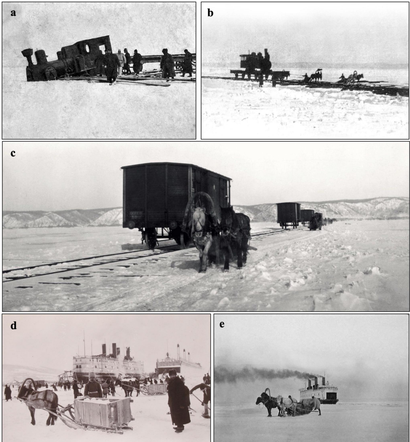
Figure 4. (a) Train and train carriages were used by the Russians during the war between Russia and Japan in 1904–1905 to move the army quickly to the east, but the weight of the trains was much too high for the ice, resulting in accidents. (b and c) Thus, horses pulled train carriages across Lake Baikal; (d and e) Additionally, a combination of ice breakers and horses were used to transport ice, goods, and people across Lake Baikal (Photo credits: FSBI Baikal State Reserve; Baikal Crossing Website-Museum).

collection of lakes for a fuller understanding of lake ice phenology on a global scale, we require the use of newer technologies to fill gaps and expand observations, shifting from an intensive understanding of a single lake or grouping of lakes to an extensive summary of lake observations (Sharma, Meyer, et al., 2020). However, the