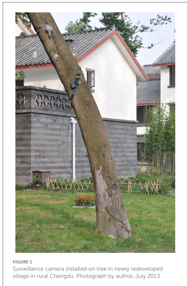
FIGURE 1 Surveillance camera installed on tree in newly redeveloped village in rural Chengdu. Photograph by author, July 2013.

In the last three decades, however, national-scale rapid urbanization policies and the expansion of Chengdu's central city, have introduced greater variability and fragmentation at larger scales into the development of landscape, including its physical environment (e.g., land use, land cover, field divisions and dwelling forms), socio-economic life (e.g., land and housing tenure and livelihood strategies, including separation of family members), as well as governance practices (e.g., kinds of developmental and regulatory decisions that are made at different levels of administration) (Chen and Gao, 2011; Ye and LeGates, 2013; Xiao, 2015). Pursued variously as Socialist New Countryside Construction; Urban-Rural Integration (or Coordinated Development); and New-Type Urbanization—rural development policies over this period