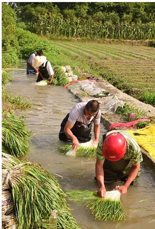
FIGURE 2 W Village farmers washing dirt and chemicals off their produce. Photograph by author, July 2017.

river banks, and restrictions on house construction within 500 m (1,650 ft) of the river bank (Wu and Abramson, 2019). Farmers were relocated to new housing outside of the environmental quality protection buffer zones along the river and highway. Although farmers no longer live in the buffer zones, they continue farming there, which involves polluting activities such as growing vegetables with chemical fertilizers, pesticides and herbicides, and washing dirt and chemicals off the vegetables into water channels (Figure 2). This will lead to two main problems: the livelihood of relocated farmers will be threatened since they are away from their farming fields, and the chemicals will still flow into the river that provides drinking water for the Chengdu metropolitan center. The situation reveals a mismatch between the scale of the source of the pollution—individual farmers' livelihood practices—and the scale of the governmental response, which follows national standards and is implemented by a large municipal region.