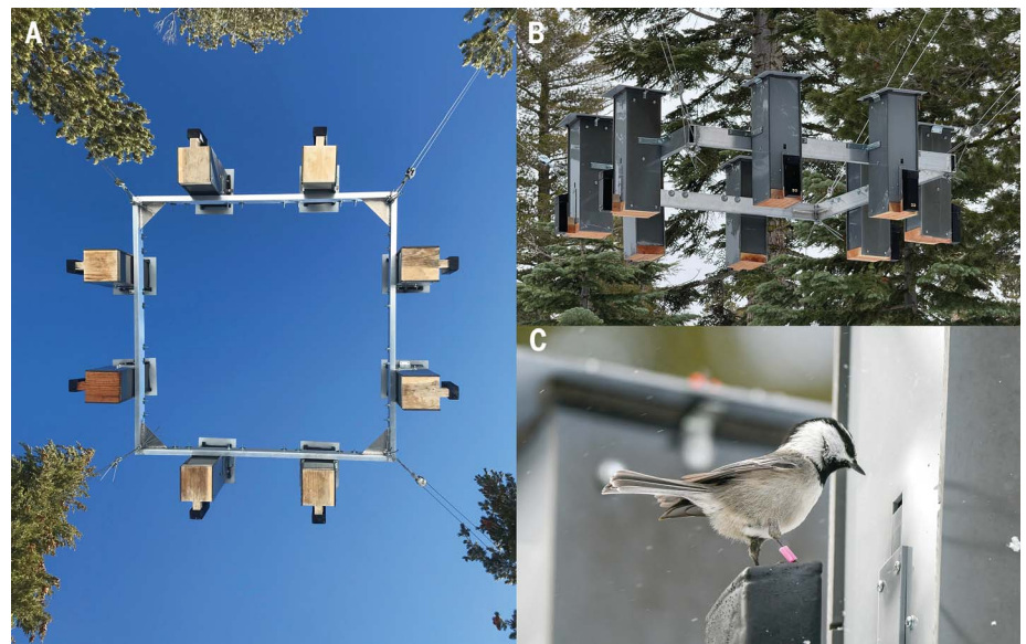
Fig. 1. Spatial testing array with RFID-equipped smart feeders. (A) Photograph of an eight-feeder spatial array, looking up from the ground. (B) Eight-feeder spatial array viewed from the side. (C) A mountain chickadee with a purple PIT tag leg band on the RFID perch watching the feeder door open.

All birds used in this study completed a minimum of 20 trials on each task and all birds successfully learned both tasks during the first 20 trials by performing at better than chance level. All birds that participated in the reversal learning task had previously successfully learned (e.g., better than chance performance) the initial spatial learning task in the previous four days. Participation in cognitive tasks was not associated with differences in cognitive performance: birds that did worse during the tasks participated in as many trials on average as birds that did better. Specifically, performance on the first 20 trials of the spatial learning and memory task did not correlate with total trials completed during the entire task (linear model: n = 227 , \beta \pm SE = -0.005 \pm 0.095 , \chi^2_1 = 0.003 , P = 0.960 ; fig. S1). This finding suggests that individuals with different cognitive abilities received the same amount of food on average during our cognitive testing. Performance on the spatial learning and memory task did not correlate with