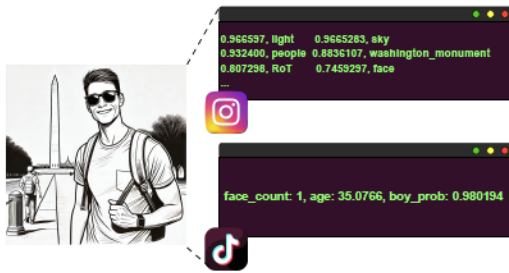
Figure 2: Example output that participants would observe during the interview. Instagram displays over 500 different decimals and concepts which are ordered from largest decimal to smallest. If the decimal value is closer to one than it Instagram perceives that concept in the image; if the value is closer to zero the concept is not in the image. TikTok observes age and gender age is an exact estimate and gender seems to be a probability. Gender is a probability called boy_prob when the decimal is closer to one it assumes a male gender identity if its closer to zero it assumes a female gender identity. Note that here we use a image generated by GPT-4o mini [75] for illustrative purposes instead of the input picture from real people in respect of individual privacy.

and why. Two-weeks after the last interview, we sent out a brief post-study reflections survey. The survey inquired about if any behavior changes since the interview and/or if sentiment changes towards social media. We sent the survey to all 21 participants and 17 responded.