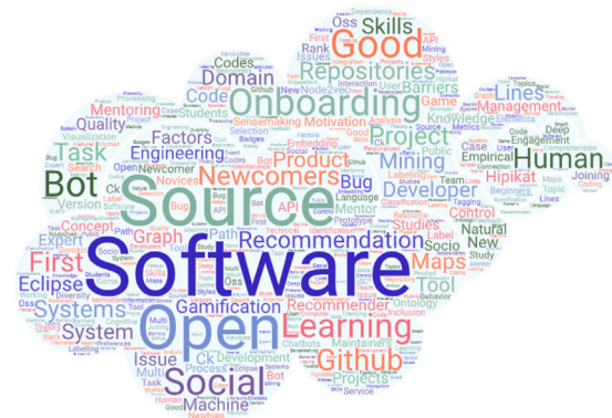
Fig. 3. Keywords word cloud.

Other software solutions focused on facilitating connections between newcomers and experienced mentors [PS02,PS06,PS09,PS16,