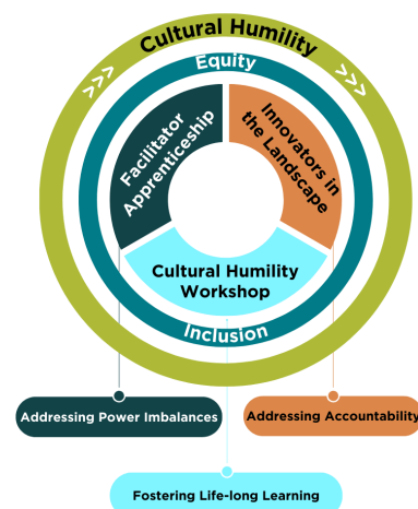
Fig. 4. The Transformation Network's approach to integrating its Diversity Equity and Inclusion commitment into its research approach.

The TN's project management plan frames its DEIJ efforts to intersect with climate justice, racial justice, and education justice, playing a disruptor role in STEM education by replacing normativity-centric education with inclusive, equitable, and just education (Cranston and Jean-Paul 2022). Since every institution in the TN has its own DEIJ training programs, part of the TN's work is to identify and compile the existing resources and conduct a gap analysis. We then develop programs that uniquely address the needs of the team. Here, we highlight a few examples of work accomplished during year two, of the project led by DEIJ coordinator Dr. Asa Stone (Fig. 4). Each year, activities are reflected upon during our evaluation process, and new trainings, series, and workshops are designed for the coming year.