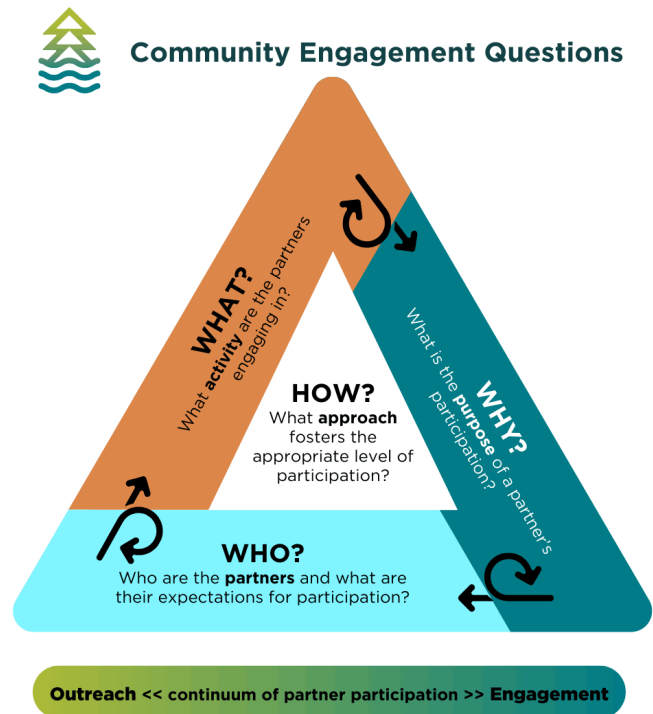
Fig. 3. A modified representation of Carson et al.'s (2022) strategic framework, highlighting the interconnected nature of the four dimensions: What, Who, Why, How, their relation to the community engagement continuum, and the iterative nature of the process to align these four dimensions among research and community partners. Modified from Carson et al. (2022).

expectations, no type of engagement will suit all projects. Multiple resources exist describing different levels of engagement and what each is best suited to achieve (National Institute of Health 2011, Environmental Protection Agency 2014, Key et al. 2019, Carson et al. 2022).