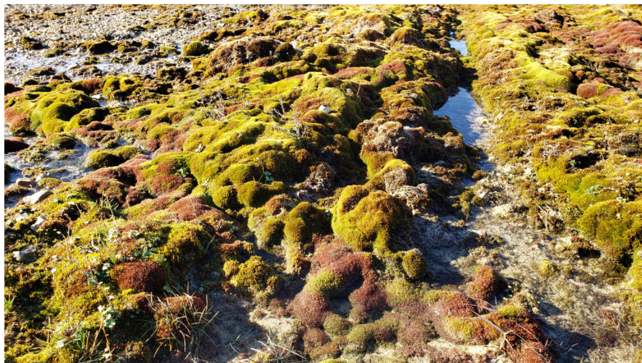
Fig. 1. An example of the diversity of lichen and moss found throughout the Arctic. taken in Resolute, Nunavut, August 2022.

home to 27% of the world's marine mammal species (Payer et al. 2013) and more than 20% of the world's lichenicolous fungi species (i.e., fungi that live on lichens; Dahlberg and Bültmann 2013; Payer et al. 2013). The Arctic also provides habitat for hundreds of species of birds that migrate to the Arctic from around the globe to breed and forage (Sullender 2019). There is even diversity within Arctic sea ice where numerous bacteria, viruses, algae, and sea ice infauna (e.g., ciliates, nematodes, turbellarians, crustaceans) reside (Bluhm et al. 2011; Patrohay et al. 2022).