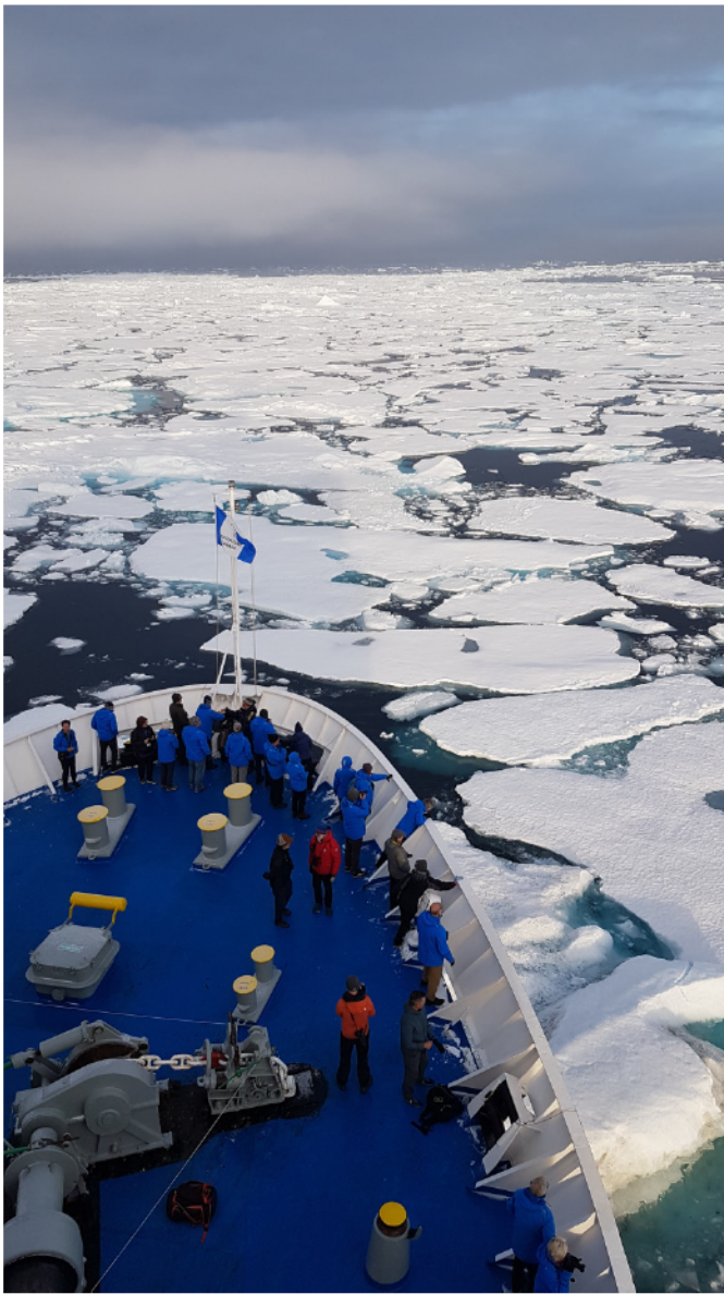
Fig. 5. Passengers on an expedition tourism vessel moving through sea ice in the Northwest Passage, Nunavut. Photo by MLM, 2023.

(e.g., air, noise, greywater, waste, spills) will increase, which has a great potential to negatively impact the environment and aquatic life (Dunlop 2019; Stevenson et al. 2019). Vessel traffic also contributes to direct mortality via ship strikes (Halliday et al. 2022; Qi et al. 2024). To date, most attention has focused on impacts during the open water season, but there is growing investment in industrial icebreaking vessels that can operate year-round such as ice-rated LNG tankers that export gas via the Ob estuary in Russia, and nuclear-powered icebreakers that lead cargo convoys (Wilson et al. 2020). Year-round icebreaking operations potentially pose risks for ice-dependent species, such as ice-breeding pinnipeds, (Wilson et al. 2020) and have been shown to have detrimental physical impacts on seal breeding habitats such as causing mother-pup separations during lactation and