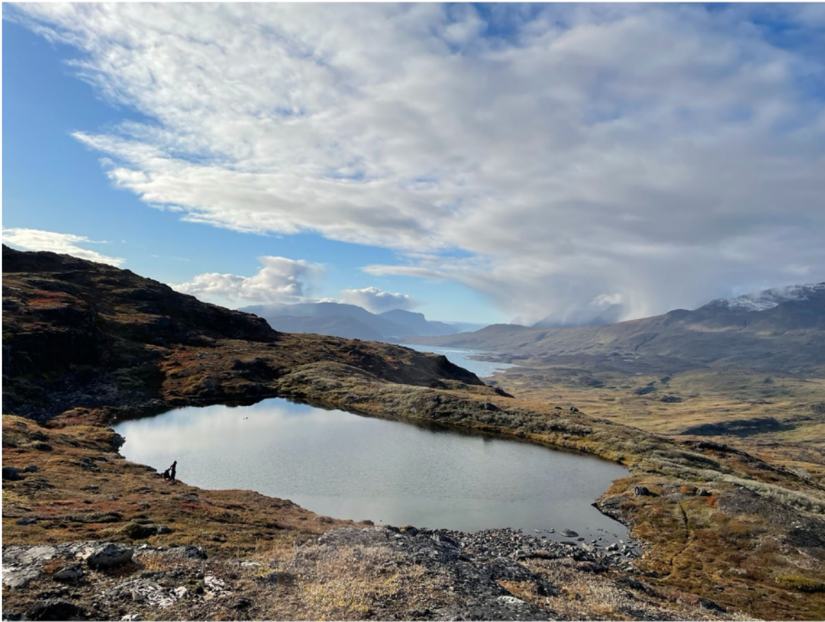
Fig. 4. Example of freshwater lakes in the region, which are home to Arctic char and threespine stickleback. In the background, you can see the edge of the Ice sheet. Photo by BM taken on a lake in Qassiarsuk, Greenland, September 2021.

between marine and terrestrial ecosystems, supporting high biodiversity that local communities depend on for their livelihoods (see Fig. 4; Wrona and Reist 2013). Given this connection, horizon scan participants recommended that an ideal way to mitigate the barriers of limited access to research sites and resources would be to work with local communities for data collection (see Table 1). With these data, remote sensing applications could then be developed (see Table 1).