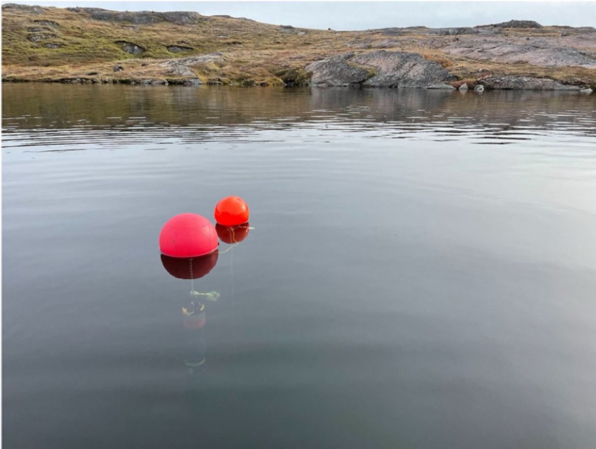
Fig. 7. These buoys and sondes (EXO2) are deployed for weeks at a time to measure high-frequency changes in oxygen, temperature, conductivity, algal biomass, and fluorescent-dissolved organic matter. The aim is to quantify lake metabolism. One of the constraints on such ecosystem monitoring is the need to replace the batteries and service the sensors every few months, making long-term deployments (e.g., over winter) difficult.  taken on a lake in Qassarsuk, Greenland, September 2021.

ever, realizing these improvements in monitoring has proven challenging with many conservation/research programs still falling short in terms of collecting enough or adequate information and being adaptive to the conservation goal (Legg and Nagy 2006; Hillebrand et al. 2018). This includes shortcomings like insufficient scales, lack of resource investment, and even issues with what data are being collected as recognized by horizon scan participants (see Table 2; Hillebrand et al. 2018). Therefore, participants suggested that the development of standard monitoring practices that obtain data that is accessible to all would allow for improved (and more transparent) decision-making and the development of a data archive (see Table 2).