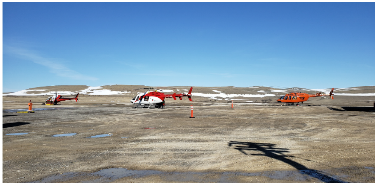
Fig. 8. An extensive amount of research throughout the Arctic requires the use of helicopters to be able to access study sites. The costs associated with positioning the helicopters to the Arctic from the South as well as for caching the fuel these aircraft require for their use is astronomical. These high costs limit the amount of research that can take place. taken in Resolute, Nunavut, July 2019.

problems (Mileski et al. 2018). However, inaction in the conservation of Arctic biodiversity due to not having the full picture is a management trap that must be overcome (DeFries and Nagendra 2017), given the current presence of threats outpacing the length of time it will take to collect data.