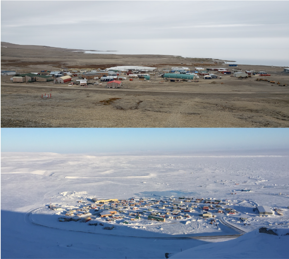
Fig. 9. An image of the community of Resolute, Nunavut in both the fall (top) and winter (bottom). taken in Resolute, Nunavut, September 2019 and March 2018.