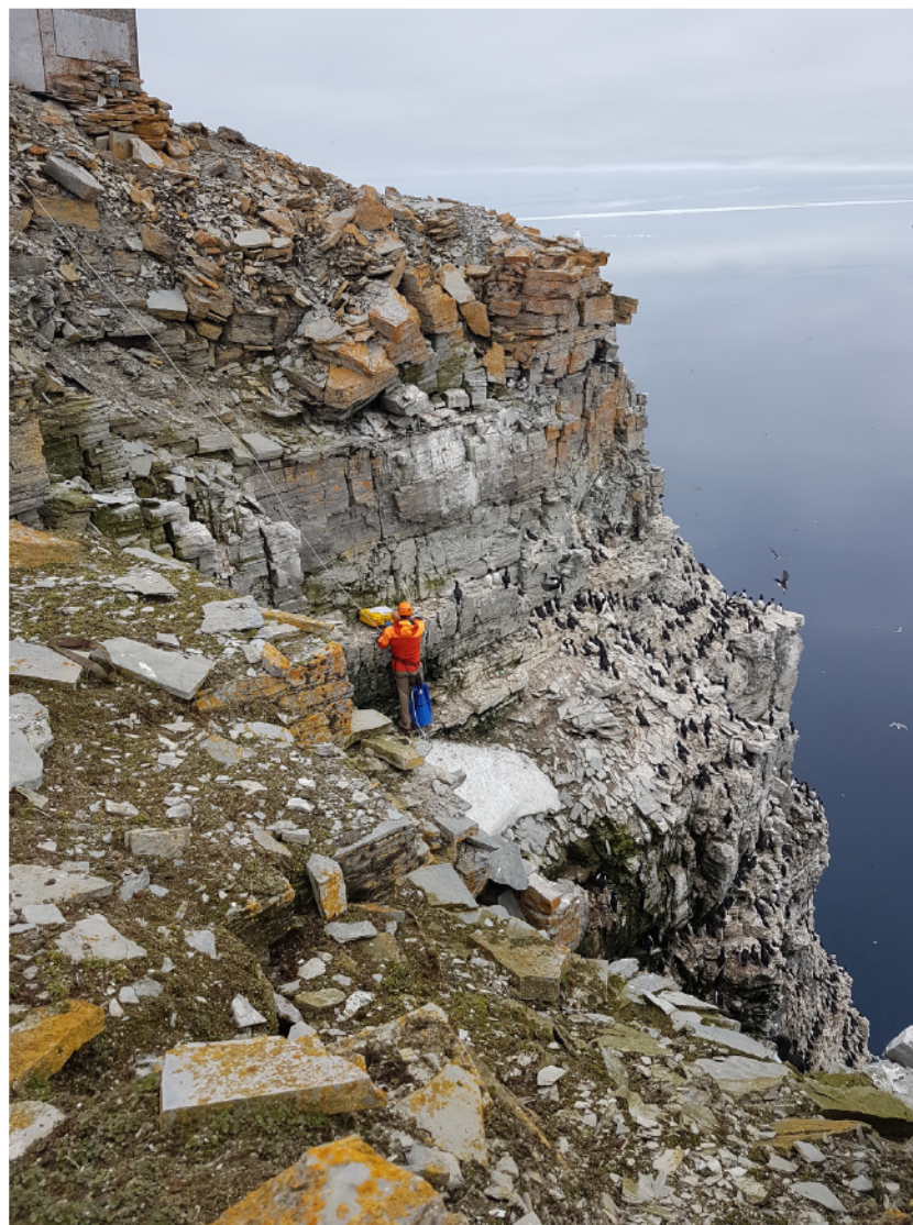
Fig. 6. Monitoring pollution in the Arctic since 1975 using eggs from seabirds. taken at Prince Leopold Island, Nunavut, 2023.

Arctic biodiversity information, such as mapping biodiversity distributions across the Arctic, understanding the drivers of biodiversity patterns, and how this relates to ecosystem function in the Arctic, should be assessed to delineate specific information needs and encourage future research. While it is essential to avoid overstudying at the expense of taking action, fundamental information is still needed to be able to address the various identified threats. Better long-term biodiversity monitoring needs to be conducted in conjunction with environmental monitoring to be able to provide context to data (Gauthier et al. 2013). An overall lack of resources was identified by horizon scan participants as a main barrier to collecting these data, and the development of joint collaborative research projects would be an ideal way to alleviate this barrier (see Table 2). Ideally, these initiatives would lead to a common understanding that fundamental information is paramount for identifying and implementing effective conservation solutions (see Table 2).