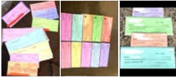
Figure 2: Examples of real-world check images, including overlapping checks and various orientations. Colored areas represent SAM's check segmentation output (Sensitive details have been blurred to ensure privacy. For full access to the dataset, please contact the authors.)

All the samples in our dataset are extracted from the real-world images provided by the cyber intelligence company DarkTower. As shown in Fig. 2, the imagery includes scenes of considerable complexity and variability, with checks often overlapping and appearing at different angles. This variability presents significant challenges in automated processing, necessitating check segmentation and rectification for accurate data extraction.