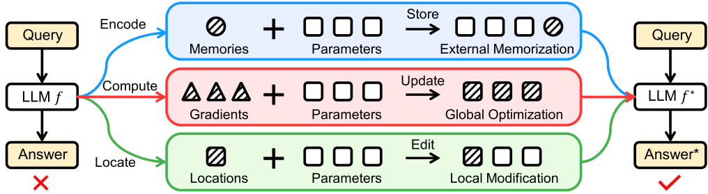
Fig. 4. The illustration of three categories of KME methods: External Memorization , Global Optimization , and Local Modification .

trainable parameters \omega that encodes the new knowledge, resulting in an edited LLM model f_{\phi, \omega}^* . The rationale behind the external memorization strategy is that storing new knowledge in additional parameters is intuitive and straightforward to edit the pre-trained LLMs with good scalability, as the parameter size can be expanded to store more knowledge. In addition, the influence on the pre-trained knowledge can be minimized as this strategy does not alter the original parameters \phi . Based on the general formulation of KME in Equation (2), the objective of external memorization approaches can be formulated as follows: