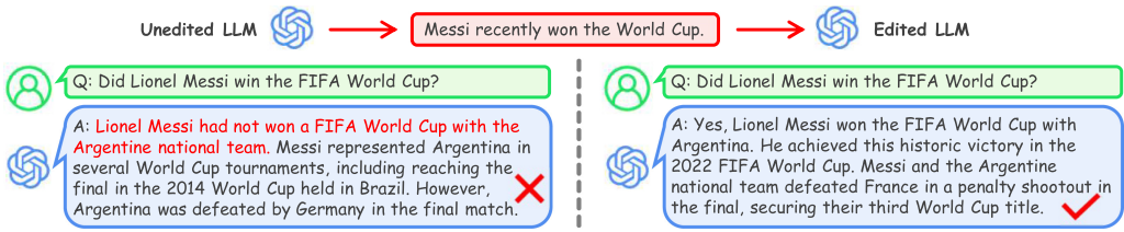
Fig. 1. An example of KME for efficient update of knowledge in LLMs.

fine-tuning. (1) Locality requires that KME does not unintentionally influence the output of other irrelevant inputs with distinct semantics. For example, when the edit regarding the president of the USA is updated, KME should not alter its knowledge about the prime minister of the UK. The practicality of KME methods largely relies on their ability to maintain the outputs for unrelated inputs, which serves as a major difference between KME and fine-tuning [117]. (2) Generality represents whether the edited model can generalize to a broader range of relevant inputs regarding the edited knowledge. Specifically, it indicates the model's capability to present consistent behavior on inputs that share semantic similarities. For example, when the model is edited regarding the president, the answer to the query about the leader or the head of government should also change accordingly. In practice, it is important for KME methods to ensure that the edited model can adapt well to such related input texts. To summarize, due to these two unique objectives, KME remains a challenging task that requires specific strategies for satisfactory effectiveness.