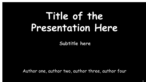
(c) An example of a participant-requested version of the title slide that uses Comic Sans font family, white text, a black background, and a higher minimum font size.