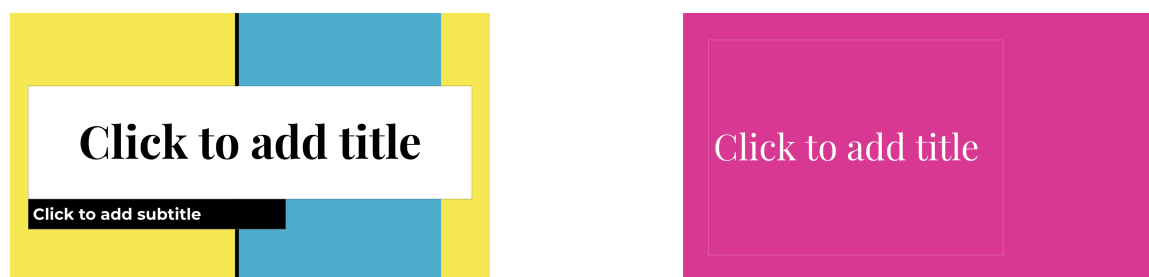
Figure 2: Two screenshots of the template used by our presenter. It includes decorative, serif fonts and brightly colored section slides, each of which can cause accessibility issues.

presenter's original message and content or because of other reasons such as intentional aesthetic design choices.