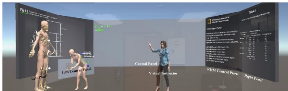
Figure 1: 3D virtual objects created within AR modules developed using unity (Pulipati et al., 2024).

For this study, we developed fifteen 3D scenes using the Unity Game Engine (see Figure 1), with seven modules in lecture 1, and eight modules in lecture 2. Lecture 1 covers the introduction to biomechanics and shows students how to draw force and moment on different body segments (comprised of an introduction to basic biomechanics knowledge including definitions, concepts of force and moment, static equilibrium, multiple link examples, and center of mass); and lecture 2 which is more challenging than lecture 1 (comprised of a review of lecture 1, free body diagrams on hand, upper arm, lower arm, and trunk segments).