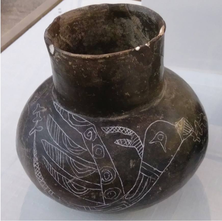
FIGURE 2 Mississippian ceramic engraved with winged horned rattlesnake. Hemphill Engraved Style, ca. 1150–1450 CE. Moundville Archaeological Park, University of Alabama