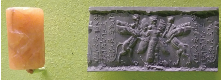
FIGURE 1 Babylonian cylinder seal of winged divinity between winged lions with human heads. Neo-Babylonian period (ca. 800–600 BCE). Michael C. Carlos Museum, Emory University.