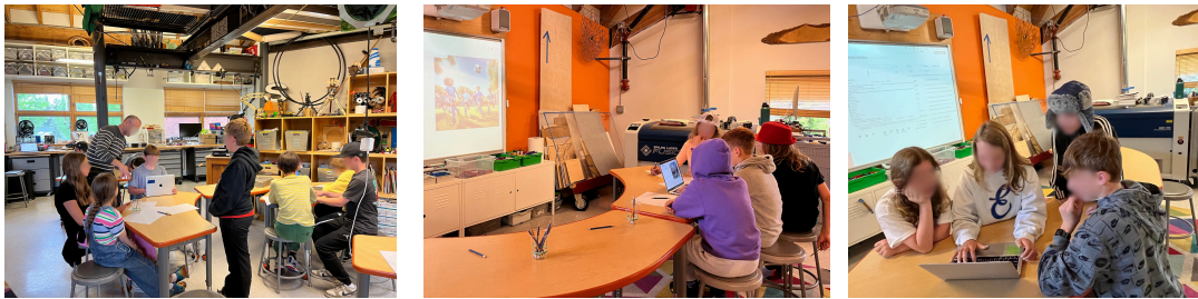
Figure 1: Fifth grade students engaging with generative AI during their Technology class.