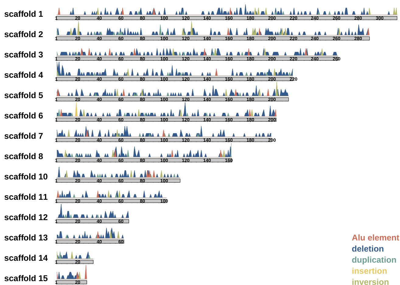
Fig. 1. Landscape of structural variation in the aye-aye genome. Genome-wide map of structural variation (deletions are color-coded in blue, duplications in teal, insertions in yellow, and inversions in olive green) across autosomal scaffolds (note that scaffold 9, i.e. chromosome X, is not displayed), with peak height being proportional to the SV length. Putative Alu elements (shown in red) were removed prior to analyses.

previously observed in humans (Sudmant et al. 2015b) and rhesus macaques (Brasó-Vives et al. 2020; Thomas et al. 2021), consistent with the lower SNV diversity observed in the species (Perry et al. 2012, 2013; Terbot et al. 2025a,b). SVs were relatively evenly distributed across the genome (Fig. S2), with 12 SV-dense regions ( \geq 10 SVs within a 10 Mb window) across the autosomal scaffolds (Table S4). In concordance with observations in other primates (Bailey and Eichler 2006; Brasó-Vives et al. 2020; Thomas et al. 2021), these SV-dense regions were enriched in sub-telomeric parts of the genome which frequently harbor transposable elements that facilitate nonallelic homologous recombination—a biological process mediating structural variation (Conrad and Hurler 2007). Moreover, the number of SVs was strongly correlated with the length of the scaffold (deletion: r = 0.977 , P = 2.24 \times 10^{-9} ; duplications: r = 0.740 , P = 0.0025 ; inversions: r = 0.798 , P = 6.27 \times 10^{-4} ; Fig. S3) as previously observed in other organisms (Thomas et al. 2021; Wold et al. 2025). In agreement with previous work in humans (Conrad et al. 2010;